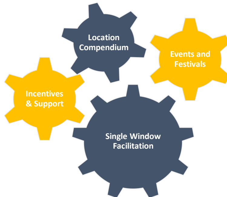
Figure 3: Initiative to promote film industry in Mumbai

Mumbai has been on the forefront of promoting the dynamic film industry by continuously taking measures such as easing filming process, offering information on location and location promotion, incentivizing the regional film production and hosting National and International events.